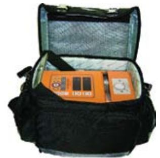
Hard Sided Carry Bag Option

Complete with Carrying Case, H.D. Tape Measure, Manual, and Technique Charts.